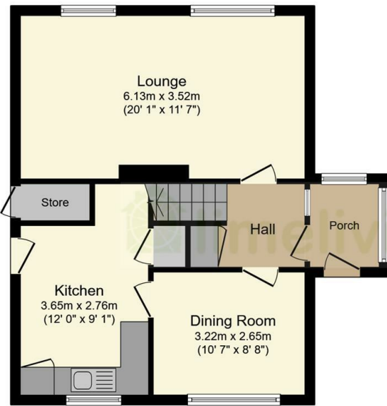
Ground Floor Floor area 53.0 sq.m. (570 sq.ft.)